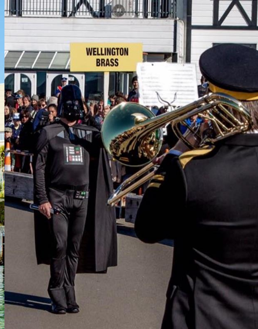
Street March Wellington waterfront around Te Papa